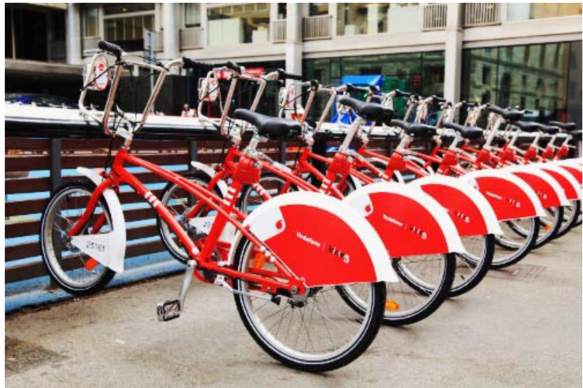
Bicing, the successful service of bicycle sharing of Barcelona

Bicing, the public service of bicycle sharing, began to operate in Barcelona in 2007. While it is true that the topography of the city - with some neighborhoods located on small hills with slopes hardly unbridgeable with a bicycle-, did not seem the more appropriate to convert the bicycle in a starred mean of transport, eight years later, the project can only be described as successful. With over 95,000 subscribers, 6,000 bicycles, 420 points distributed throughout the city and an average of over 1,000,000 trips a month, the service, besides, has incorporated, since the month of December 2014, electric bicycles to its offer.