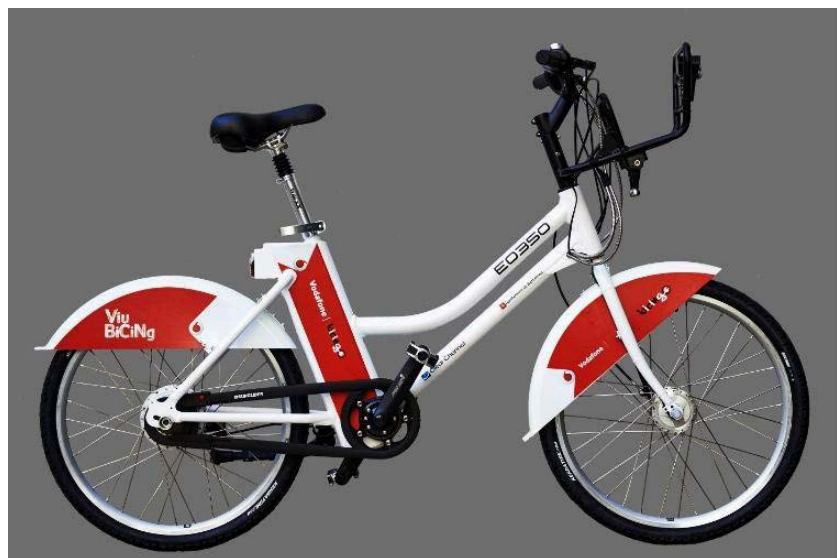
The electric model of Bicing

The first step in the commissioning of the electrical Bicing consisted of a pilot in which only a limited number of users (1,500 enrollees) had access to this service. Currently, the service has 46 stations, 41 of them in underground car parks. It is still early to assess the results and the reception given by the service users. And, however, an electric bicycle proposes only help pedaling, which differs quite of what a motorcycle can offer.