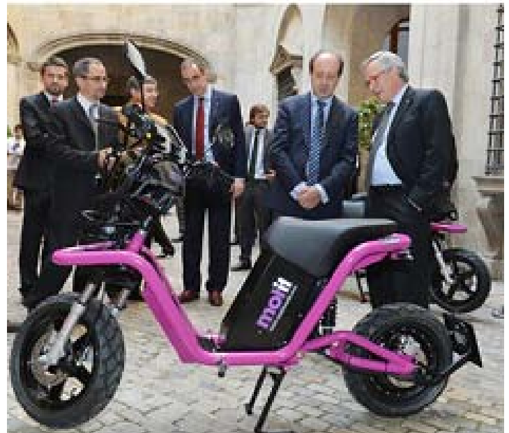
Former Mayor of Barcelona in the presentation of Motit to the media

In any case, initiatives such as this and the landing of rental companies of electric motorcycles with a more traditional profile have made of Barcelona one of the European cities where more vehicles of these characteristics circulate.