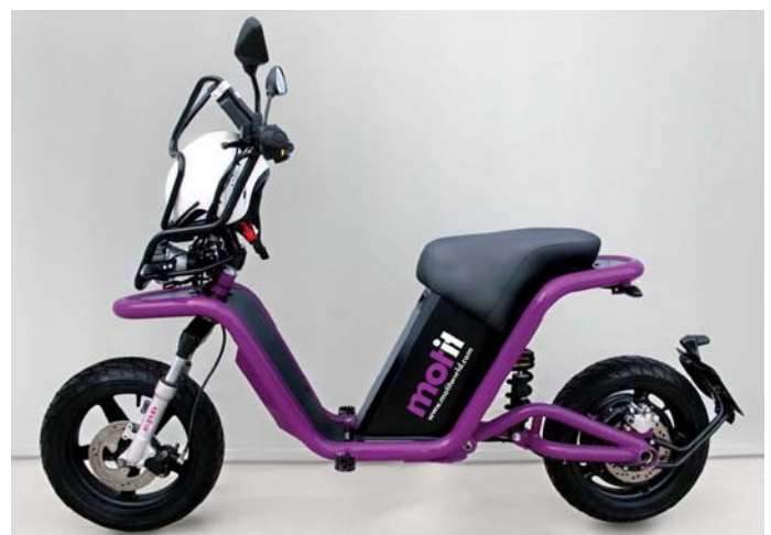
The Core, the specially designed model for Motit service