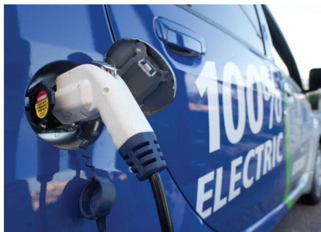
A car which makes part of the fleet while charging in one of the charging pillars which was funded as part of the DemoEV project

It is expected that electric mobility in the Maltese islands will have various advantages. Electro mobility should reduce traffic emissions while improve grid loads, urban planning and road communications.