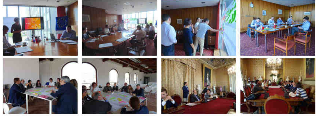
Some pictures from the "Ambition workshop" in Newcastle (first row) and Palermo (second row).

This report synthesizes the work done during that first stage of the Project and it has been set up thanks to the contribution and findings of the 8 "Ambition workshops" held in the partners' cities, Eindhoven, Tallinn, Murcia, Istanbul, Sant Cugat del Valles, Newcastle, Forli y Palermo.